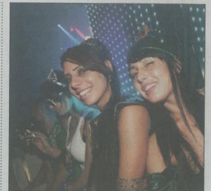
Easyjet is launching flights to Tel Aviv - and its legendary nightlife.

If you're heading to the World Cup in South Africa next June, and thinking about making a trip of it, you may be interested in a new boutique travel company, based in Cape Town. Run by a previously London-based couple, Cape Active (00 27 28 272 9723; capeactive.com ) will help you not only with self-catering